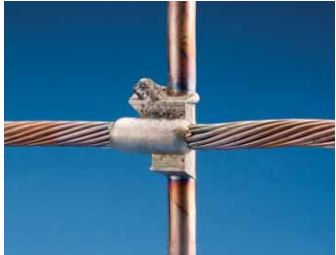
Completed GY connection